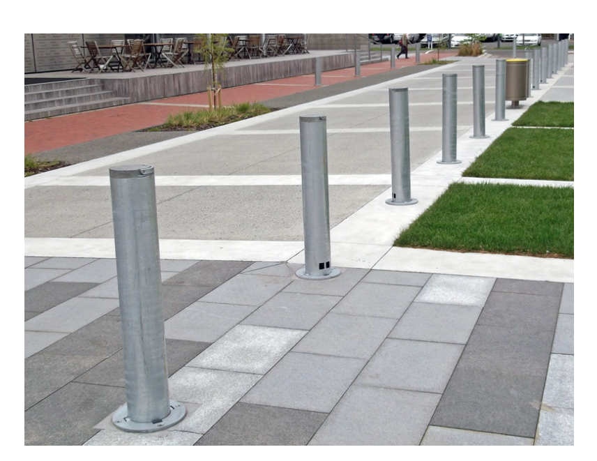
Retractable Bollard, Lower Hutt Civic Centre

The robust and sturdy Retractable Bollard is normally supplied with a hot dip galvanised finish. It can be powder coated to colour of choice if required.